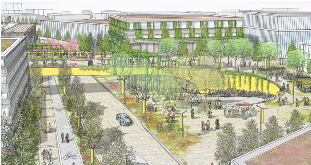
(Illustration of Salford Rise over Frederick Road)

Facilitated through revised urban grain with all routes leading to the Transport Hub at the heart of the Framework area and improve movement from the surrounding residential communities.